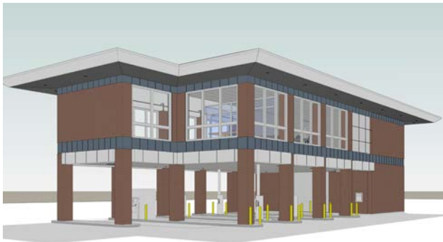
New Teller Facility , Back View